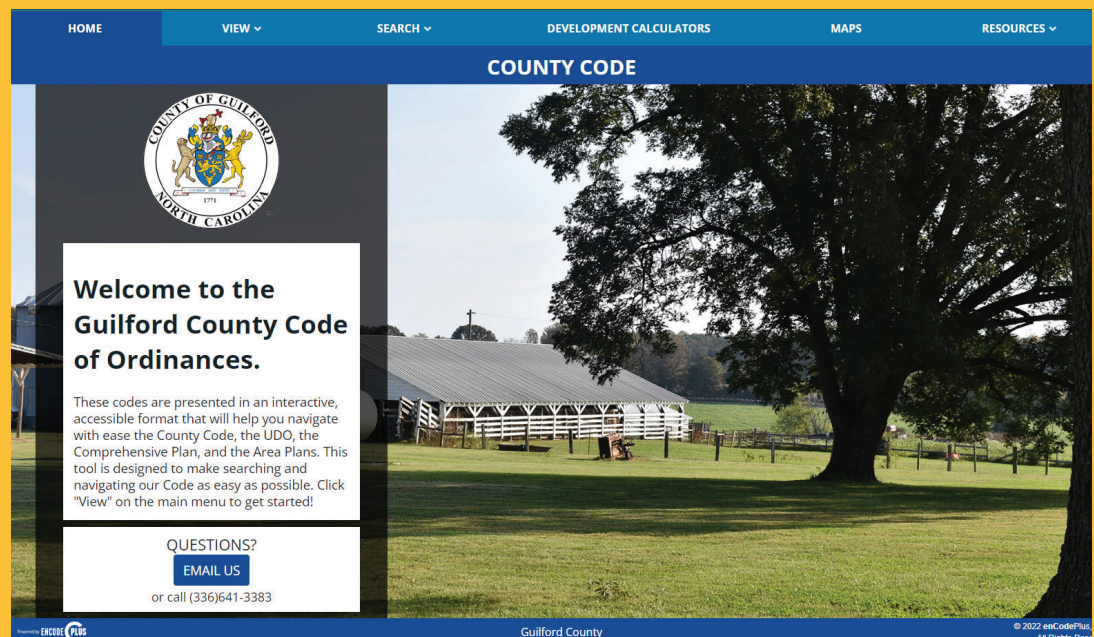
Screenshot of the custom Plan Navigator